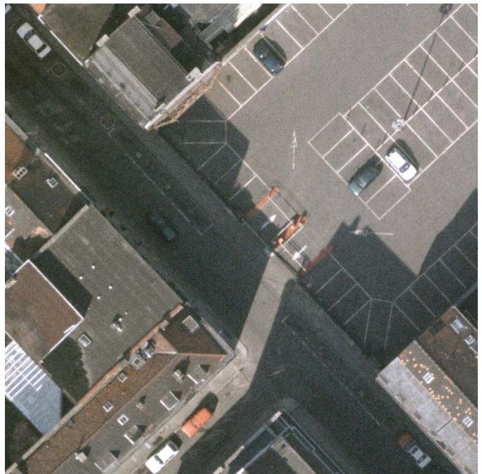
CLEANED IMAGE - NO DUST AND SCRATCHES

The image is scanned twice – once with RGB light and once with IR light. The IR image is used to detect exactly where and what is foreign from the original image. Software then utilizes surrounding image information to remove the foreign matter from the original RGB image.