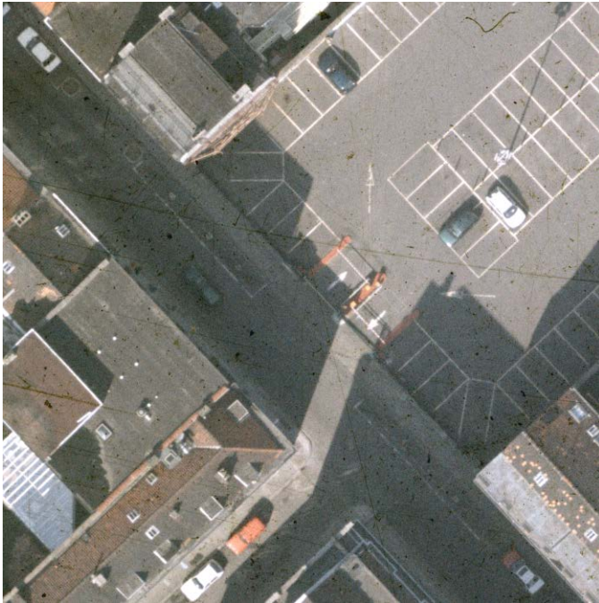
IMAGE WITH DUST AND SCRATCHES